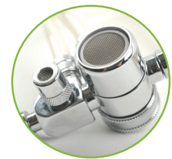
Dual-Hose Diverter Valve for use with Countertop Kit