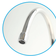
Faucet for use with Below-The-Sink Kit